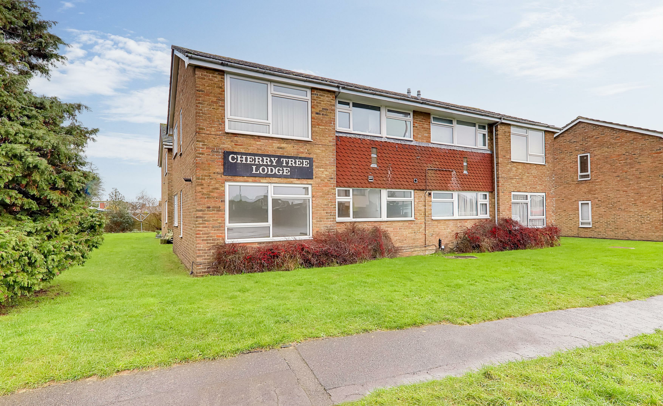
7 Cherry Tree Lodge Boundstone Lane, Lancing, BN15 9QH £950